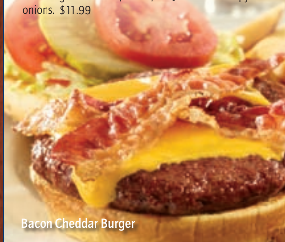
Bacon Cheddar Burger

Smoked gouda cheese, bacon, BBQ ranch and crispy onions. $11.99