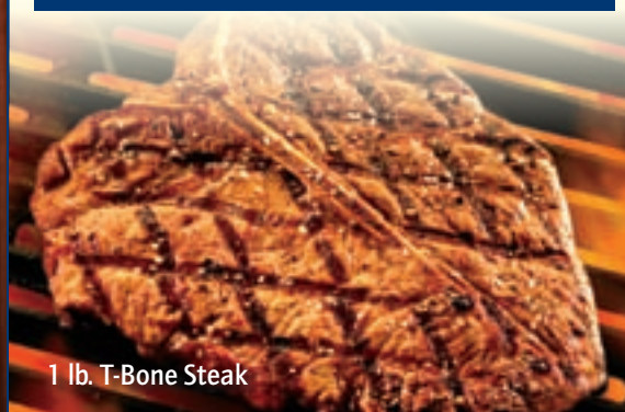
1 lb. T-Bone Steak