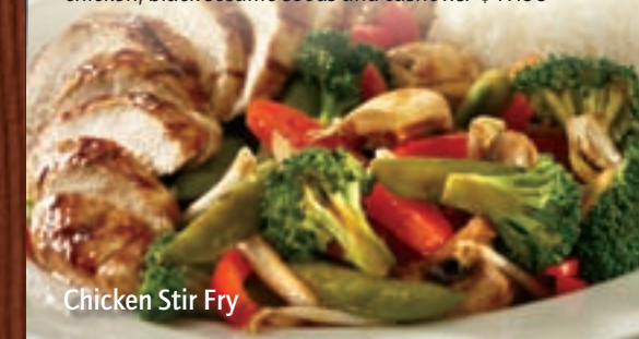
Chicken Stir Fry

Fresh broccoli, red peppers, mushrooms, Spanish onions, and sugar snap peas pan seared in peanut sauce with Asian noodles, topped with sweet chili glazed battered chicken, black sesame seeds and cashews. $11.99